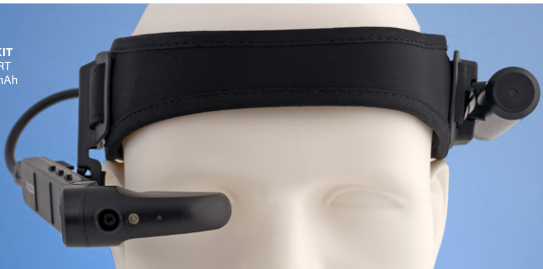
VUZIX M400 XTREME KIT WITH ALL-DAY COMFORT HEADBAND AND 3200mAh XTREME WEATHER POWER BANK

Vuzix optics have defined the AR industry, and the M400 takes full advantage of our energy-efficient, ultrabright OLED display system. Share your perspective in superior detail with our 4K video streaming auto-focus camera, and get the remote assistance you need in real time. With noise-cancelling microphones, wide field of view, and voice inputs, you can keep critical data right where you need it while staying hands-free and heads-up.