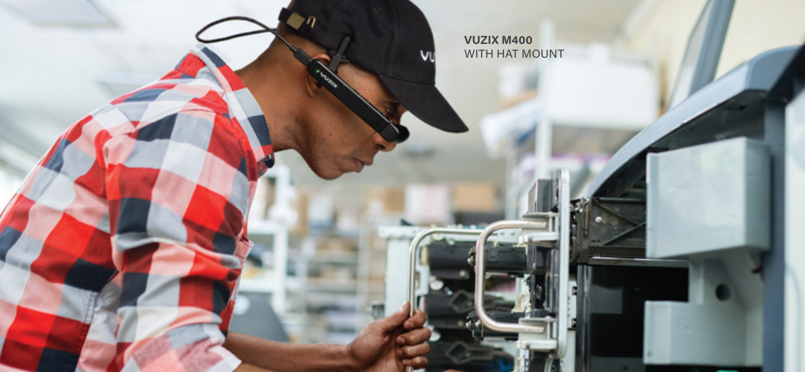
VUZIX M400 WITH HAT MOUNT